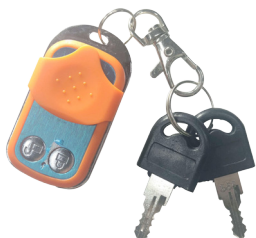
Remote control and keys