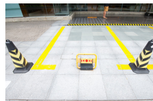
Private parking management